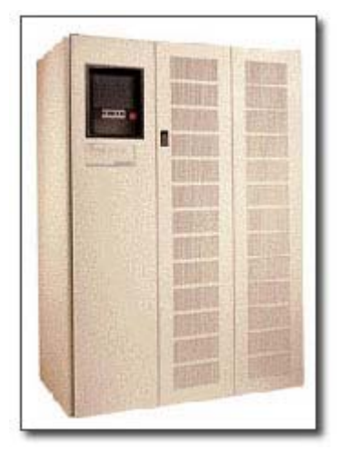
Fig. 1 Outside view of an UPS system

In the design of the sources, notice that they are not built self-sufficient in addition to their necessities to make them more powerful and perfect in their functions, so that it is much more usual to find in all activity areas that correct operation is absolutely depending on the supply of their units and reference instruments.