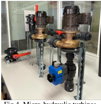
Fig.4. Micro-hydraulic turbines.