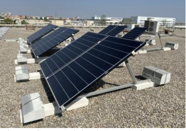
Fig. 1. GEDERlab photovoltaic panels.

The photovoltaic installation comprises three key elements: solar panels, charge controller, and inverter. Strategically positioned on the roof of the laboratory building, the photovoltaic solar panels are designed to capture solar radiation and directly transform it into electricity. Specifically, a total of 9 SERAPHIM SRP-310-E11B solar panels with a capacity of 310W STC (230W NOCT) each are deployed, providing and effective total power of around 2,1 kW peak for solar generation. Figure 1 illustrates the photovoltaic panels installed on the roof of the Building 5E in the UPV where GEDERLab is located.