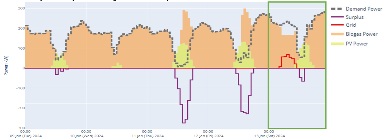
Fig. 7. Resource Allocation in Aras de los Olmos.

With the aim of analyzing the technical feasibility of the theoretically conducted resource allocation, the resources of GEDERlab are employed. Among all available equipment, the photovoltaic installation, the diesel generator set (simulating biogas), and the grid will be utilized. While the utilization of other renewable energies is feasible, the aim is to assess the technical feasibility of unit allocation for a day, using the resources available in the municipality of Aras de los Olmos in the near future. For this study, the last day of Figure 7 (highlighted in green) has been selected as the trial day. To achieve this, the municipality's demand curve is scaled to a replicable power level in the laboratory. However, it is necessary to consider the limitation regarding power regulation of the generator group. Power regulation of the generator group is only possible in increments of 1 kW. In the future, this regulation will be enhanced to increments of 0.1 kW. With this limitation in mind and based on the demand curve of January 13, 2024 (Figure 7, highlighted in green), the unit allocation conducted in the laboratory is depicted in Figure 8.