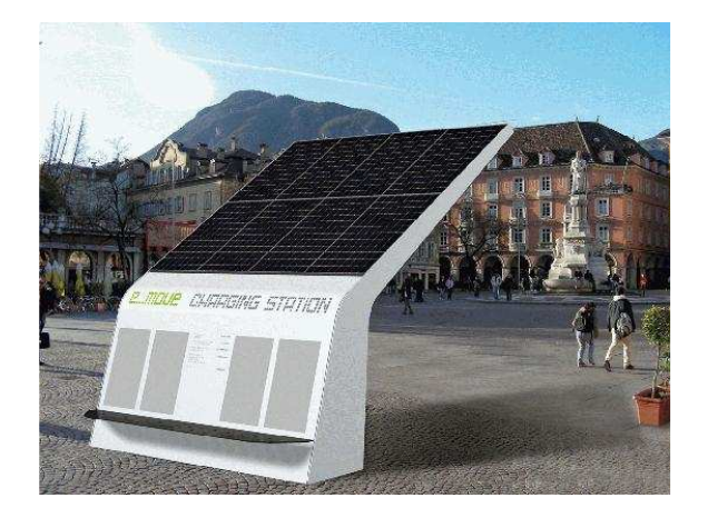
Fig. 6. Charging station (solar energy)

CO_2 emissions of electric cars are lower than those of conventional cars, but the amount of savings depend on the emissions intensity of the existing electricity infrastructure. Now it is possible to find charging stations that avoid this problem. For example, solar stations like the show in Fig. 6, Bolzano (Italy).