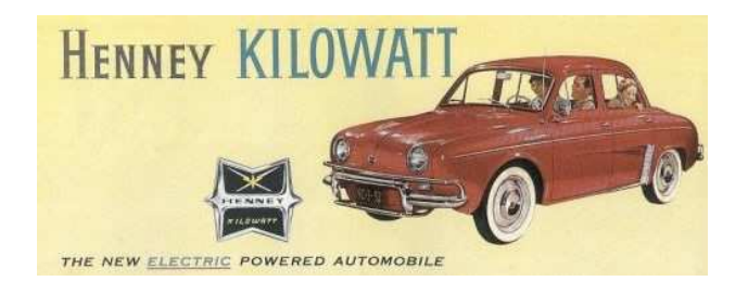
Fig. 1. Henney KILOWATT

The first modern electric car based on transistor technology, the Henney Kilowatt (Fig. 1), was built in 1950s, this car improved performance with respect to previous electric cars, consumers found it too expensive compared to equivalent gasoline cars of the time, and production ended in 1961.