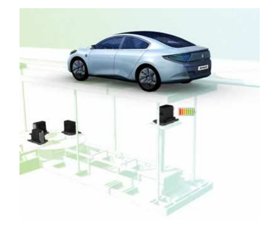
Fig. 3. Quickdrop charging system

And the third one is quickdrop charging (battery) exchange, 3 minutes for a new fully-charged battery), as shown in Fig. 3. When: On open roads or motorways to "top up" the battery operating life during a long journey, or for standard charging when there is not enough time.