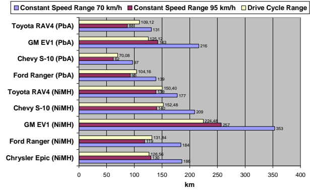
Fig. 4. Comparison between different EVs

Fig. 4. shows a comparison of the range in kilometres of EVs from the last 15 years depending on the speed parameter and drive cycle range with a full charge of the battery [6].