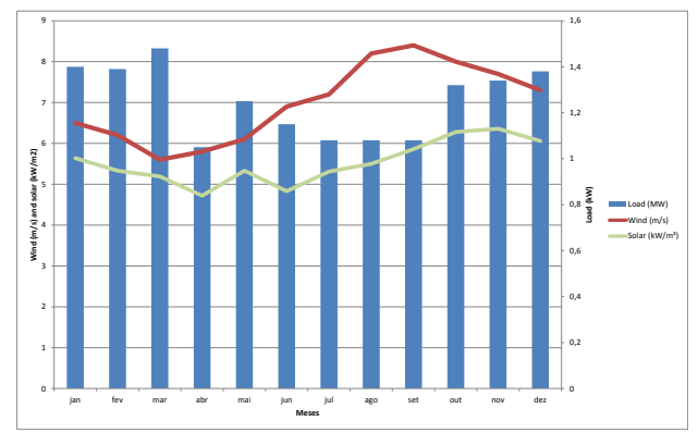
Fig. 3. Load and renewable resources.

Fig. 3 shows the load and the natural resources for the Noronha Island.