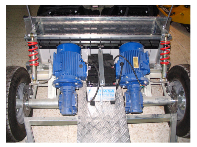
Fig. 3. Batteries and power train