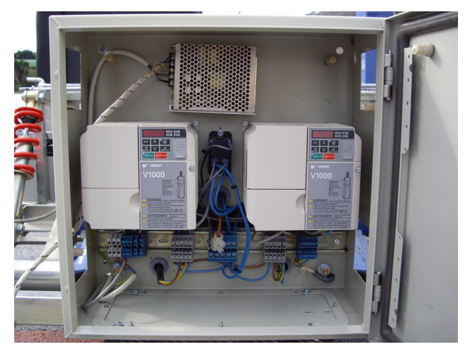
Fig. 4. Power controllers.

promote the technological independence of developing countries.