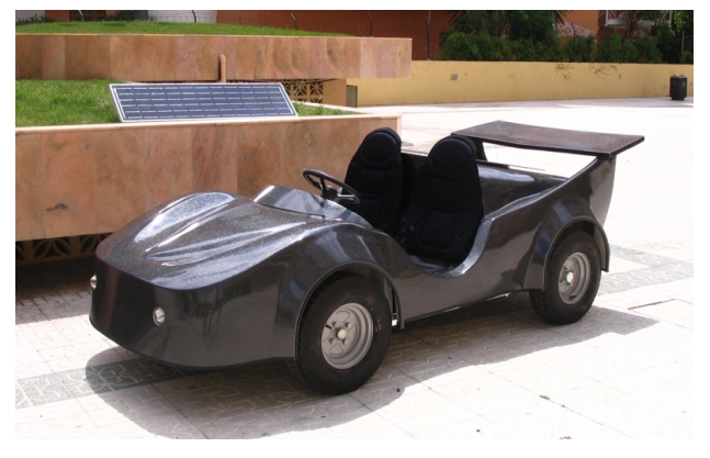
Fig. 2. General overview of the EV