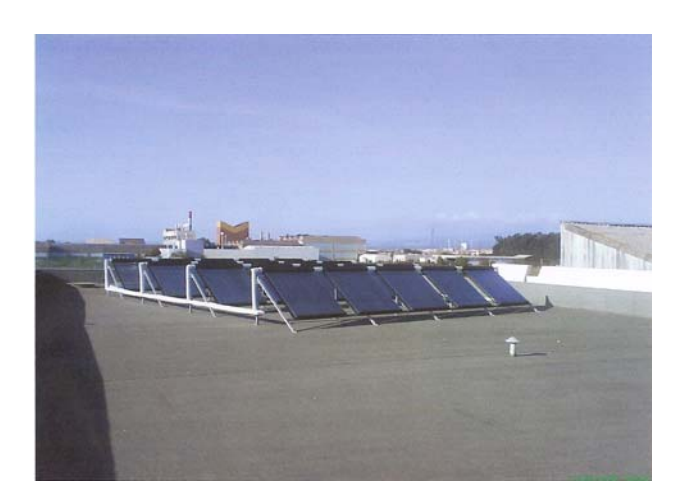
Fig. 7. Installation of 20 solar thermal panels in the north building.

In this case, the gas consumption data throughout the year allows direct assessment of the facility economic interest, whose design lifetime of 20 years ensures profitability, environmental improvement and an interesting period of investment return as shown in Table 2.