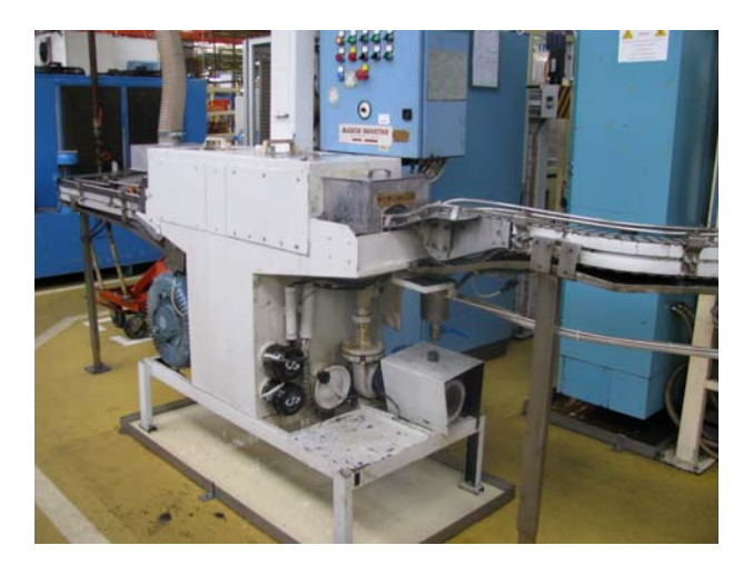
Fig. 5. Components washing module system.

The observation of thermal losses in large washing machines used in the factory led to the development of a new concept: instead of large systems that require constant technical support and full load to be used efficiently, a new solution based in small washing modules integrated in the supply chain enabling washing a piece individually, with minimum consumption of energy, water and detergent. These modules are heated by electric heaters and controlled by temperature sensors that automatically turn on and off the heating of water flow and components drying with high efficiency.