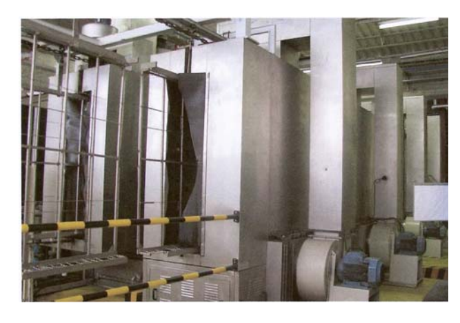
Fig. 4. Logistic units washing system.

The current washing high efficiency of handling and transportation units for bodies and mechanical components has been improved with new equipment (cheaper) fed by a high thermal efficiency circuit (low heat losses in ducts).