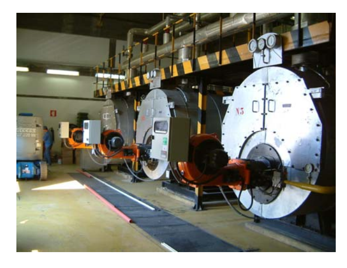
Fig. 3. Heating boiler (3).

The production efficiency and hot water supply to various plant equipment, including centralized washing of handling and transportation units of components and mechanical parts between factories, and the thermal comfort in production areas has been improved by installing a new distribution system with high thermal efficiency (closed circuit water flow and low thermal losses in duct walls) between the fluid central shown in Fig. 3 and equipment.