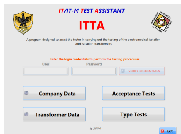
Fig.2. Home page screen

On the user interface developed graphically on the front panel, at the start of the program the user name and password of the tester must be entered to avoid changes to the test data by external personnel (having the final declarations legal value).