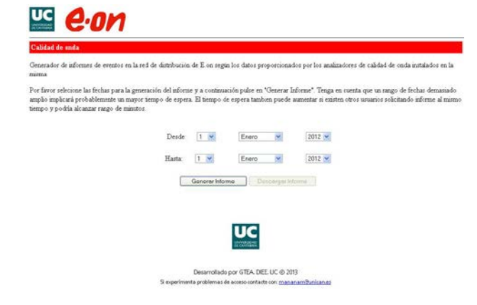
Fig. 3. Web application.

The interface allows the user to define period of time of the analysis. Then, the engine application obtain for all the available nodes a summary of the most important PQ parameters: