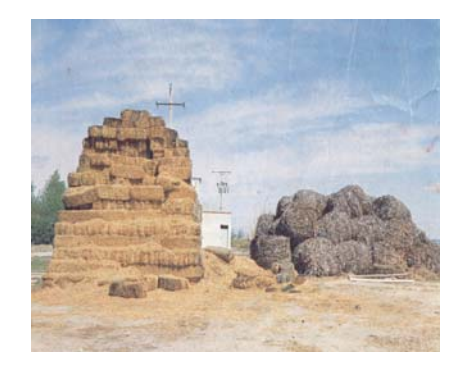
Figure 1 - Straw from cereal

Vegetal biomass constituted by cereal straw represents one of the most abundant vegetables residues currently generated. Residue generation represents 1 kg of straw per kg of grain harvested. This ratio grain/residue results in 400 million metric tons of crop residues yielded year in year out in the USA, and 330 million metric tons in Europe ([2] y [3]). As an example, more than 10 million metric tons of cereal straw are yearly produced in Spain, where 50% is barley straw, 40% wheat straw, and 5% oats straw. Most of these fibrous residues are burnt on the own land where they are harvested, this activity producing the emission to the atmosphere of contaminating gases, and the destruction of local micro flora [4]. Due to this harmful environmental impact, it is very interesting to value these by-products by means of treatment in such a way that they can be conveniently utilized either as energy resources or as a complement in the diet of cattle after transforming it.