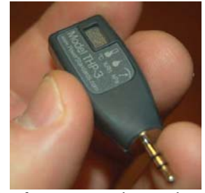
Figure 5. Probes for parameters that may be related to power quality are included: Temperature, Humidity, Barometric Pressure, etc. A GPS satellite receiver can ensure precise timing.

Perhaps more important, the communication cost of an installed power quality instrument, over the life of the instrument, often exceeds the cost of the instrument itself. Whether the communication is via Ethernet, or telephone modem, or short-distance radio, bringing the communication signal to the monitoring point is a significant cost.